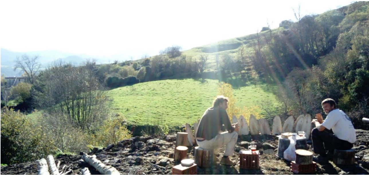
View from the land