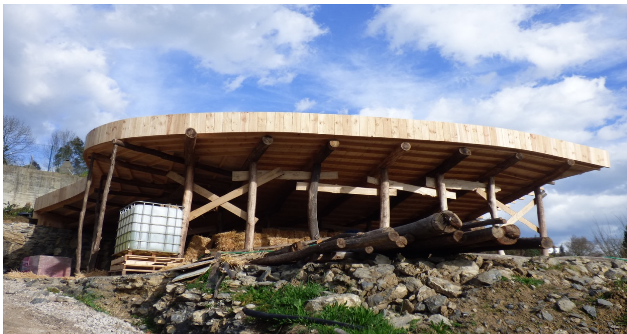
State of the build (March 2017)

This is a passive solar heated house with post-and-beam structure in eucalyptus and living roof, which will have straw bale walls, plastered with cob. It is on a 2200m 2 plot of land with outstanding views over the beautiful Aras valley, in a small village 15 min from Laredo, 35 min from Santander, 50 min from Bilbao. Interior: 60 m 2 with 60 m 2 garage. At the moment (March 2017) the house is under construction, with the wooden frame and the roof finished. Plans approved for a second phase, round, with 80m 2 on two floors.